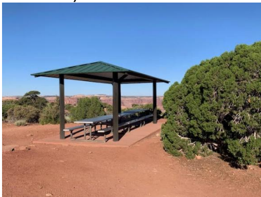
Picnic #3 One shelter/three tables and a large parking area