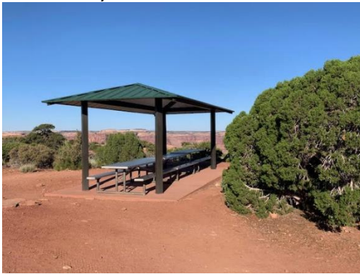
Picnic #3 One shelter/three tables and a large parking area