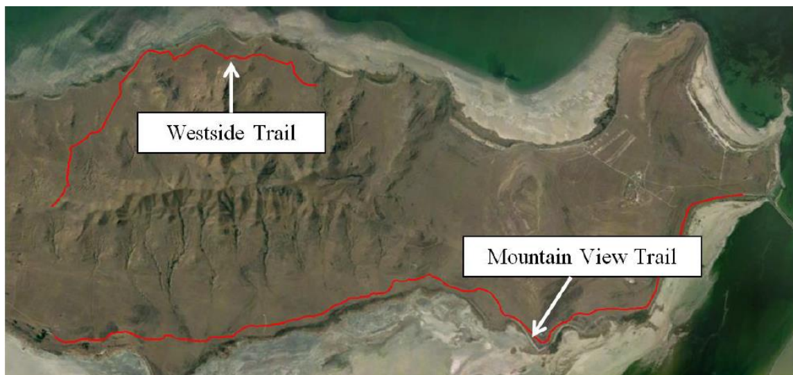
Figure 2. Mountain View and Westside Trails. Caches are not permitted along these trails.

The Mountain View Trail (Figure 2) lies parallel to the East Side Road and is located nearly entirely in the travel controlled area of the park. It has been observed that geocache hunters are parking their car on the road and illegally short-cutting over to the Mountain View Trail to access the cache. It is an overwhelming temptation to illegally cross-country over to the trail since that is much closer to the cache than using the established trailhead. Individuals have been cited for taking this short-cut. Consequently, caches are no longer permitted along the Mountain View trail