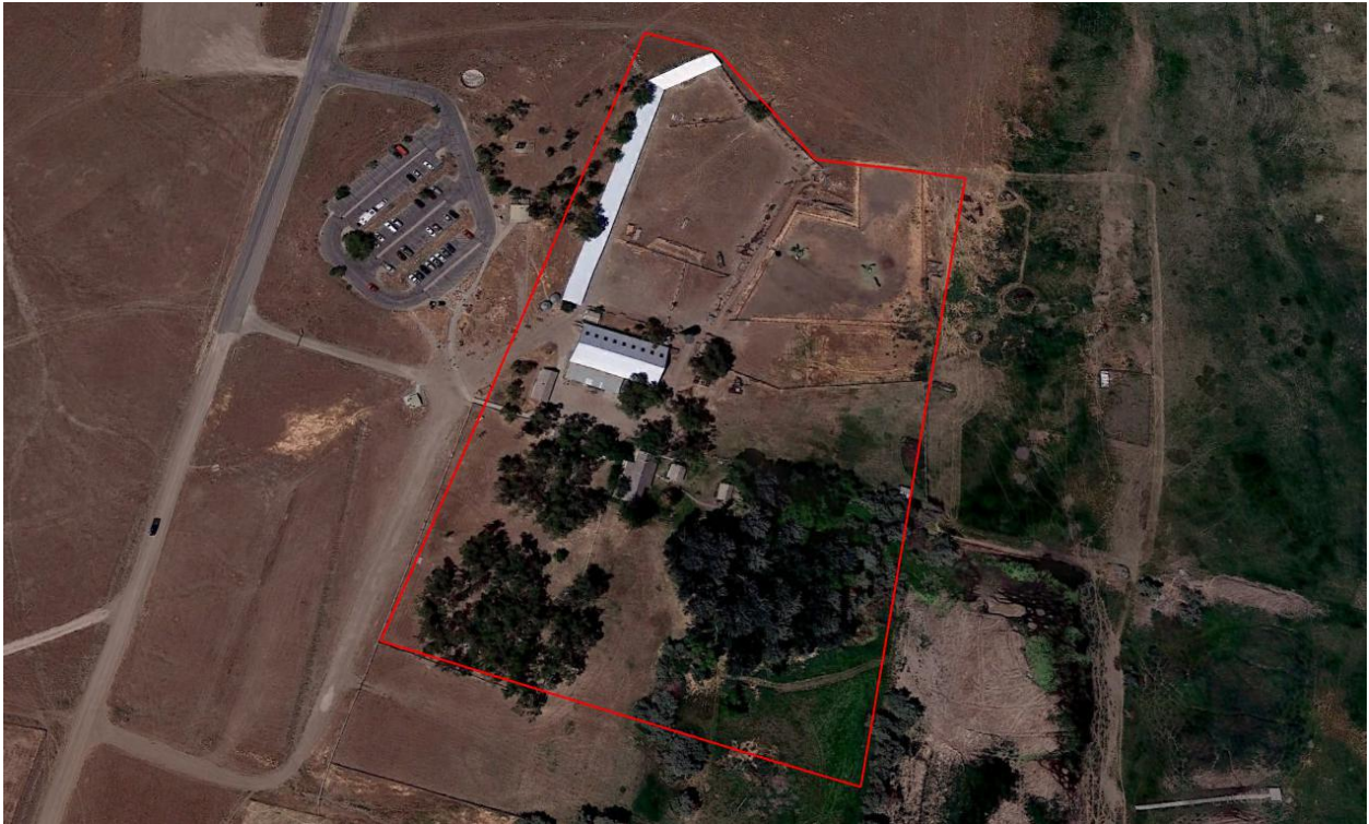
Figure 3. Garr Ranch. Geocaching is not permitted within the delineated area.

The Garr Ranch (Figure 3) is located on the east side of the island at the south end of the paved east side road. Because of high visitor traffic, presence of historical artifacts, and the need to control resource and environmental impact, the placing geocaches within the designated area in Figure 3 is not permitted.