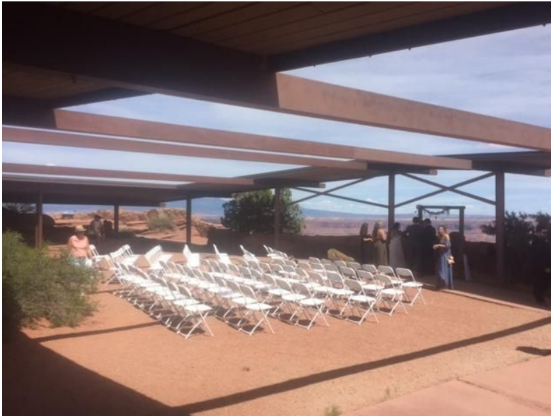
View from shade shelter area