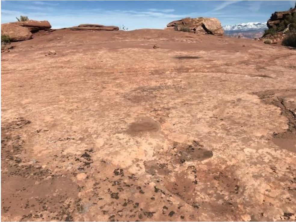
View from La Sal site