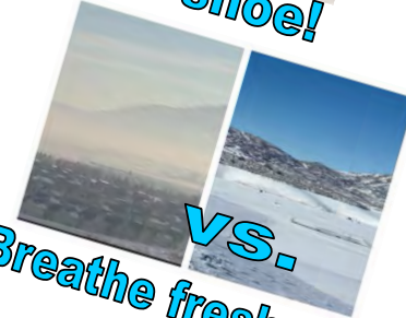
Breathe fresh air!