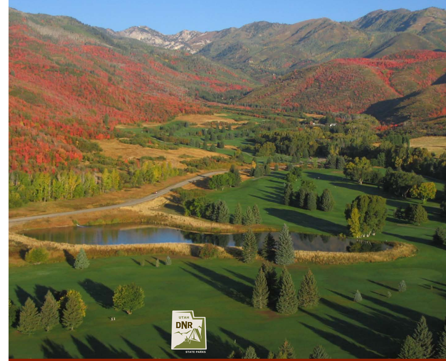
Utah State Parks